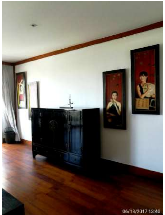
Pimarn Mansion (Penn Sathorn) Unit 10