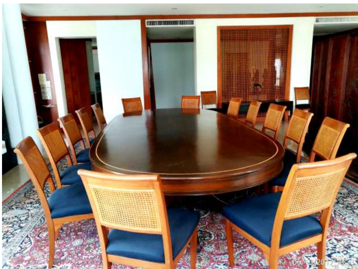
Pimarn Mansion (Penn Sathorn) Unit 10