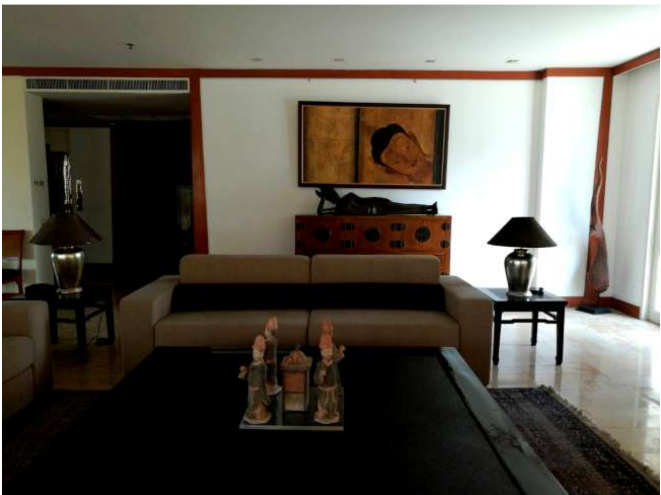
Pimarn Mansion (Penn Sathorn) Unit 10