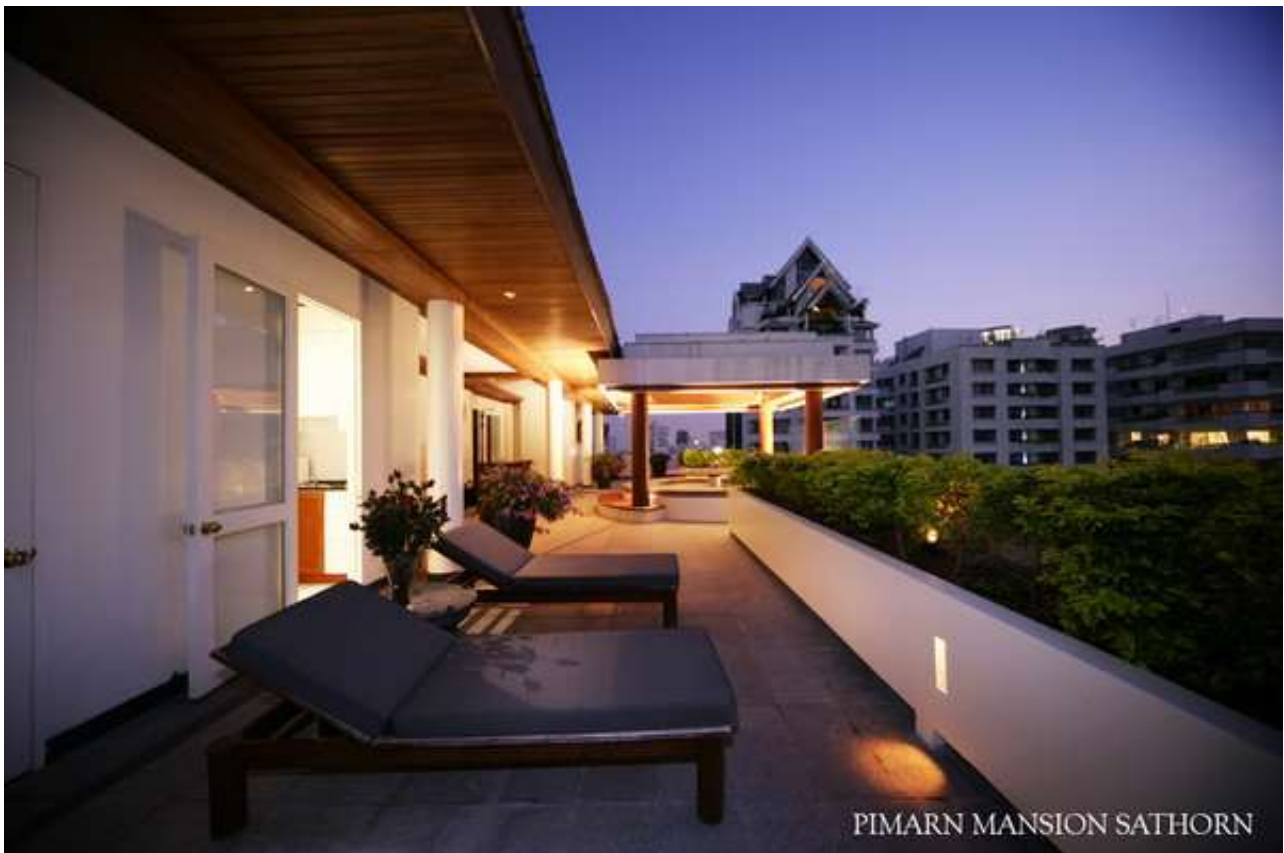
Pimarn Mansion (Penn Sathorn) Unit 10