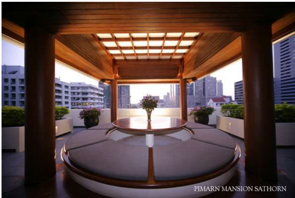
Pimarn Mansion (Penn Sathorn) Unit 10